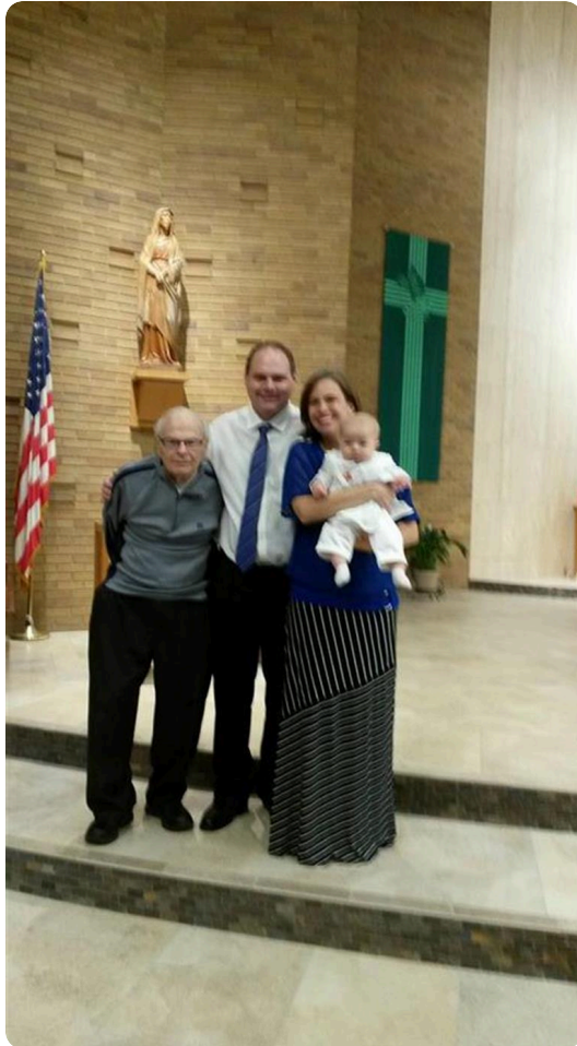
Grandpa with Grandson and Great Grandson