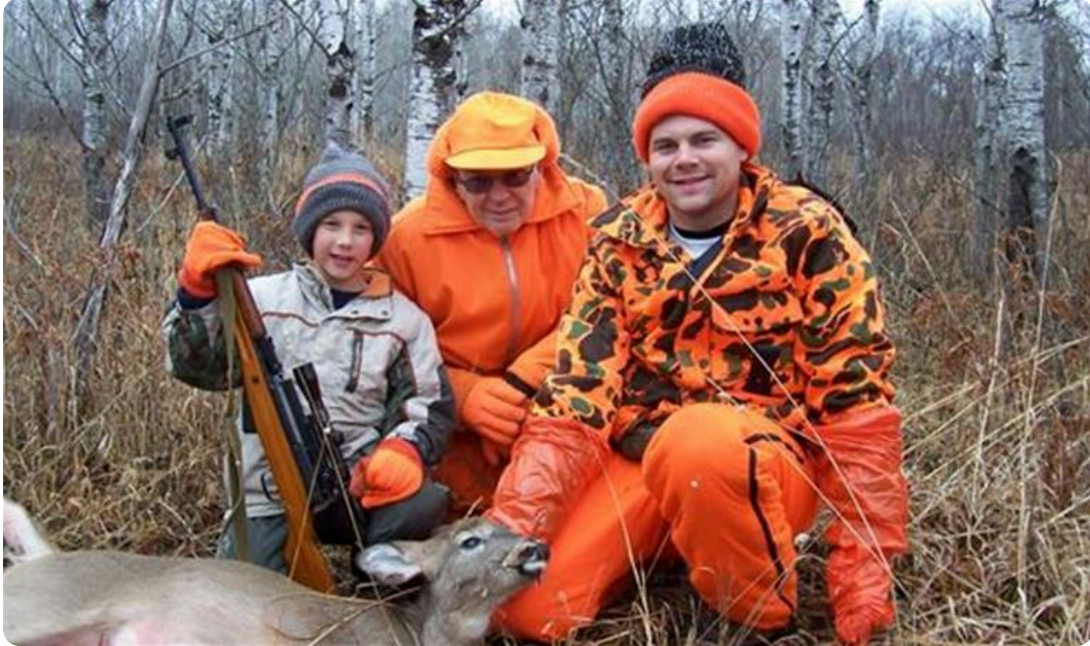
He Loved to Hunt and be up north.